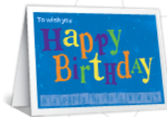
A Very Good Year