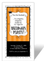
Fun Night-ful Party-Invitation